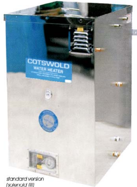
standard version (solenoid fill)

*Stainless-steel elements are not immune to build-ups of lime-scale or attack by water-borne acids. In some areas local water-treatment may be necessary.